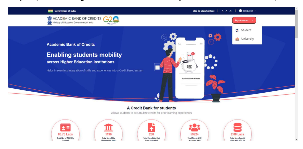
Step II: Go to Sign up.

Step I: Open www.abc.gov.in in the browser. Click on My Account Tab. Select Student option.